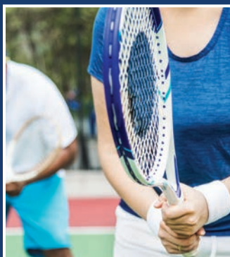
Sports | 40