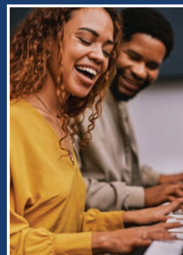
Music | 26