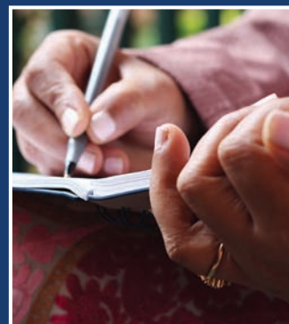
Writing | 29