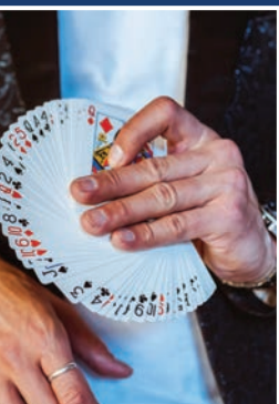
Hobbies | 40

575+ professional development and personal enrichment courses ...discover what's next!