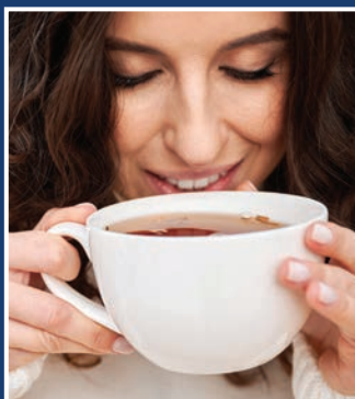
Beverages | 21